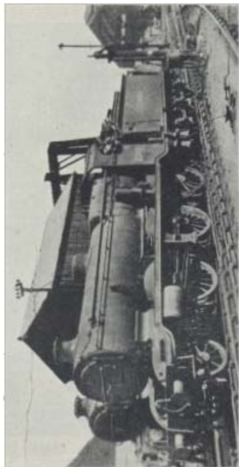
Billinton Mogul No. 2343 at Brighton shed