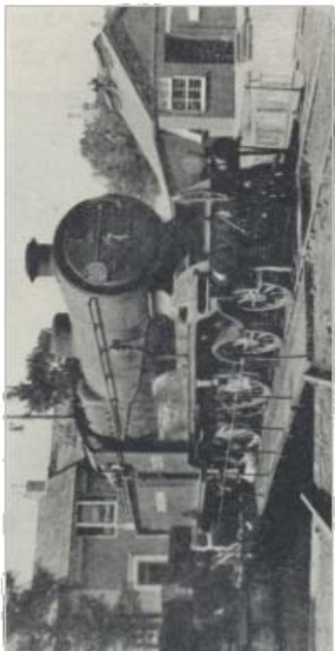
"B4X" 4-4-0 No. 2073 on the turntable at Brighton