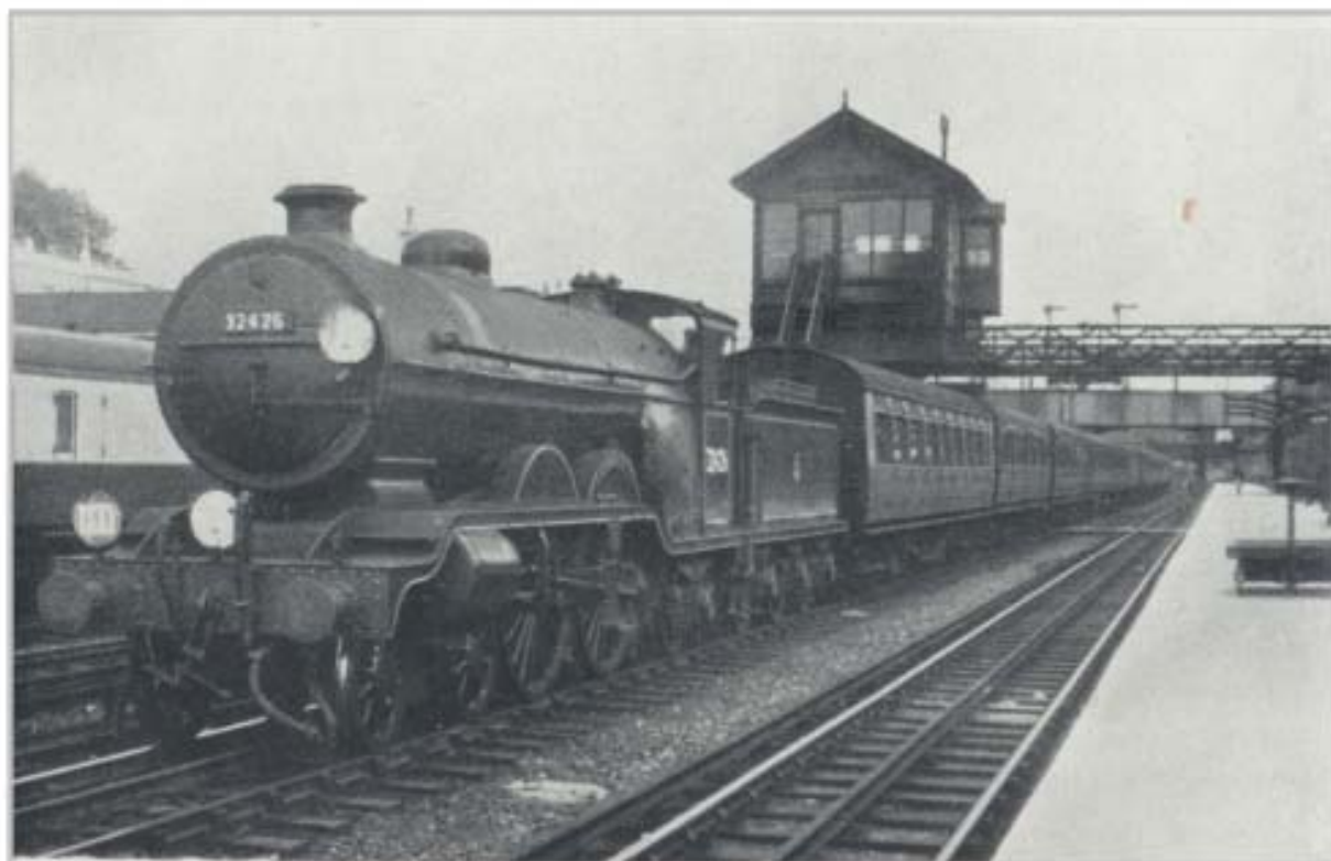
Hastings-Manchester (Saturdays only) through train passing Kensington (Olympia) on July 29, 1950, headed by former L.B.S.C.R. Marsh Atlantic No. 32426, "St. Alban's Head"