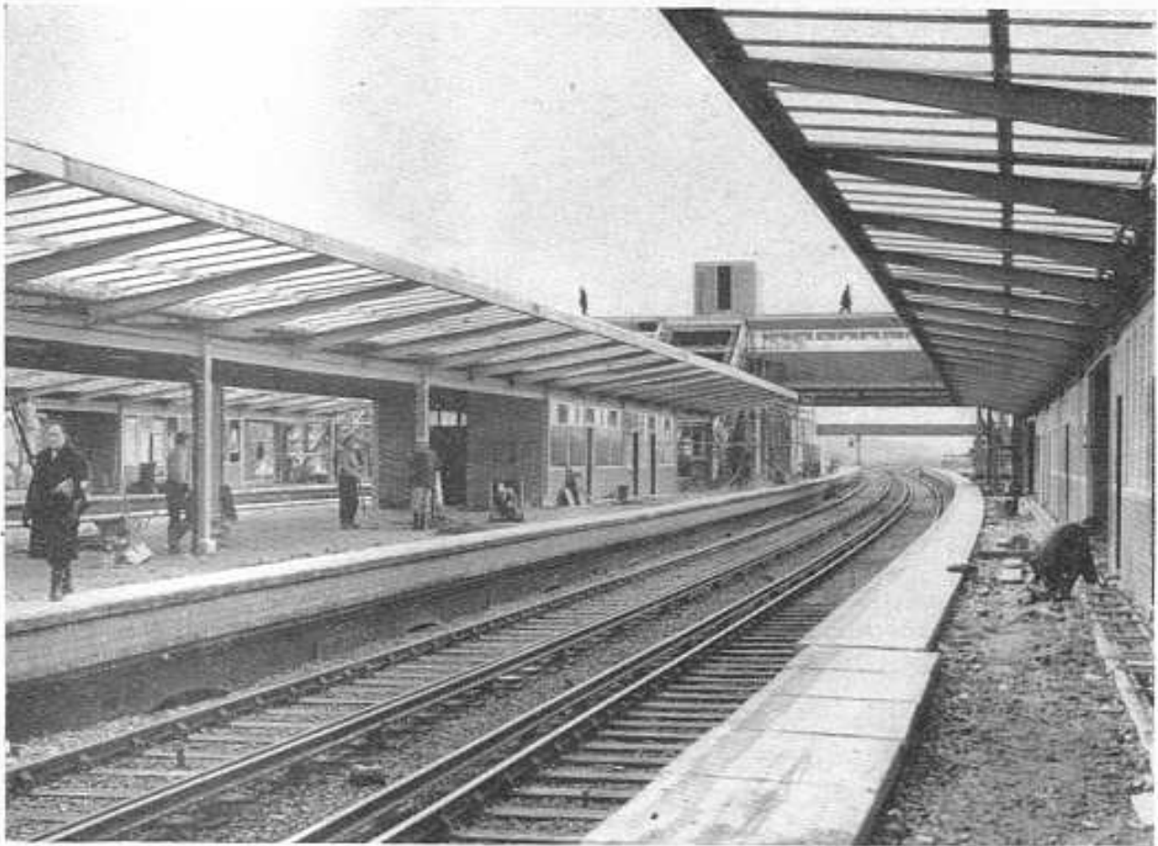
Looking from the main airport platform (right), which serves the reversible line, towards the other two island platforms during construction

Associated with the scheme is the lengthening of the platforms at Purley, Coulsdon South, Merstham, and Redhill to accommodate 12-car trains, and the provision of additional berthing facilities for electric stock at New Cross Gate, Three Bridges, and Horsham. Track and signalling alterations between Gloucester Road Junction and South Croydon to convert the down relief line between Windmill Bridge Junction and South Croydon into a reversible line have been completed at the same time.