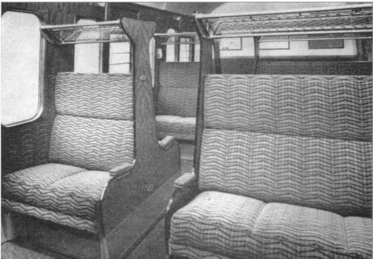
Interior of a saloon coach, showing seating arrangement