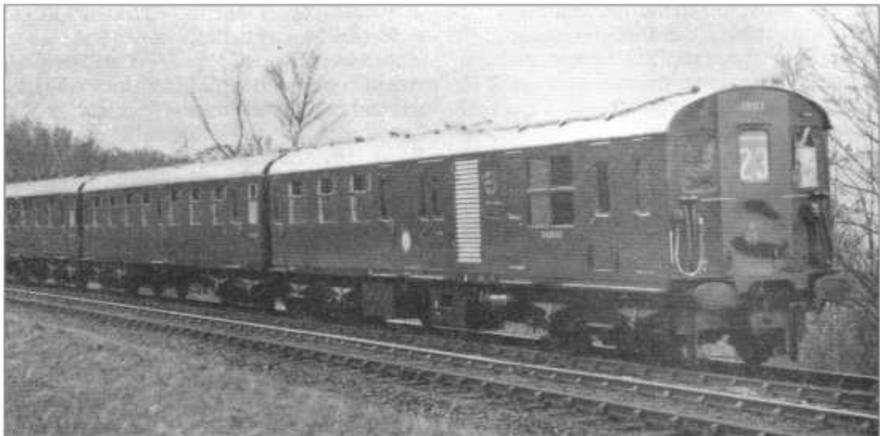
Motor and trailer coaches of new diesel-electric train for the London-Tunbridge Wells-Hastings services

I MPORTANT additions to the multiple-unit rolling stock of British Railways entered service recently. In the Southern Region, diesel-electric trains have been inaugurated between London and Hastings, via Tonbridge and Tunbridge Wells; and on the electrified suburban lines of the London Midland Region, from Euston to Watford, and from Broad Street to Richmond, new rolling stock is replacing that previously in use.