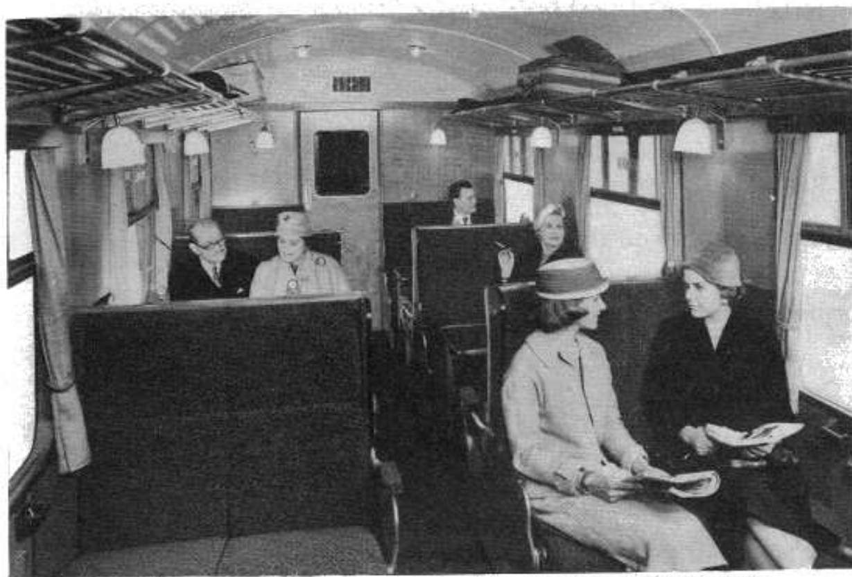
Open second class saloon in one of the London-Hastings sets

Control equipment consists of electro-pneumatic and electro-magnetic contactors and group switches. All of the power contactors and relays are carried in one case suspended from the underframe. The remaining control gear is carried in the auxiliary cupboard which forms the partition on the offside of the driver's cab. The air reservoirs, air