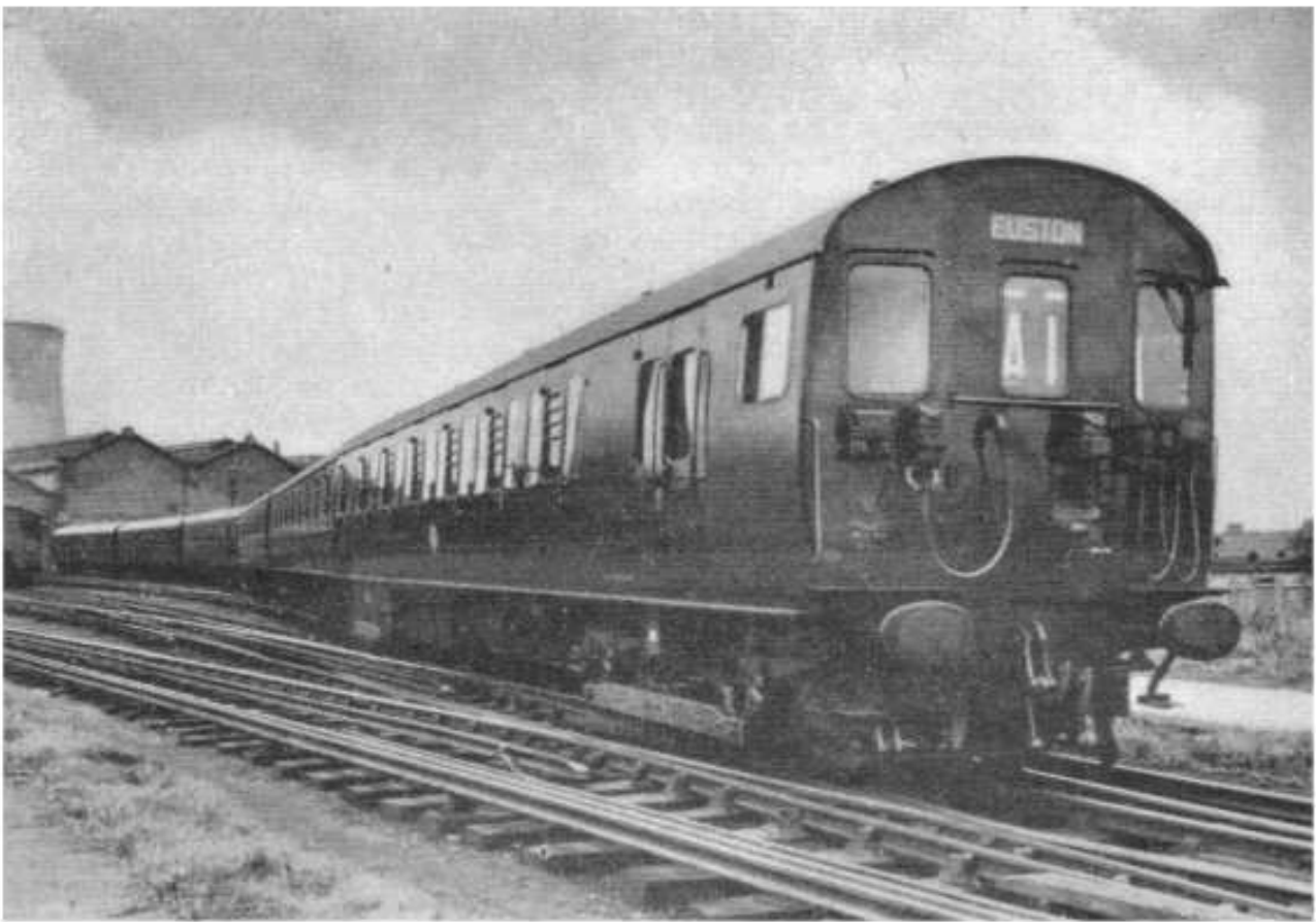
Train of two three-car sets at Stonebridge Park Depot, on the London electrified suburban lines of the L.M.R.