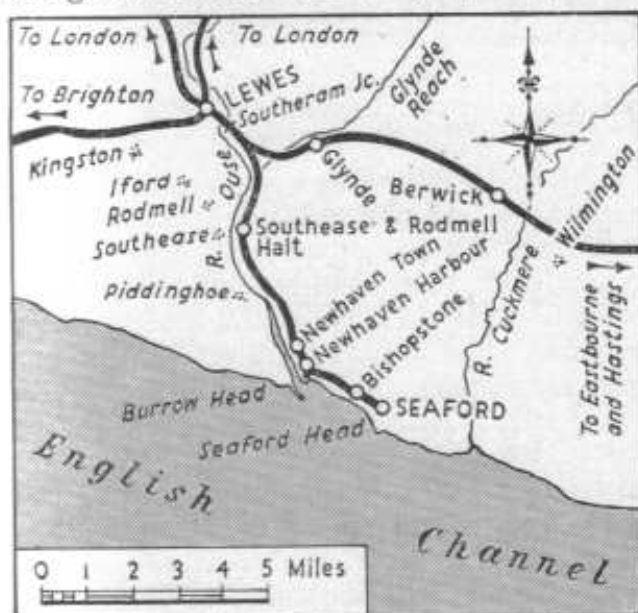
Map of the railway from Lewes to Newhaven and Seaford

artificially when the course of the river was straightened during the second half of the nineteenth century. The centre arch of the proposed bridge was to be movable to permit navigation, and after crossing the river, the line would turn south to a station and dock at Sleepers Hole in Newhaven, from where the railway company intended to operate a regular cross-channel service to Dieppe. However, at a meeting of the Trustees of the Ouse Lower Navigation & Drainage on December 30, 1845, it was decided not to consent to the construction of a railway bridge over the Ouse as proposed, with